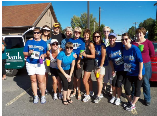
Pictured above: Billings Association members at last year's run.