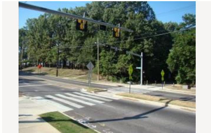
The Memphis Complete Streets Program includes new bike lanes and pedestrian crossings at major intersections.